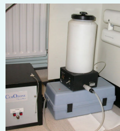
Fig. 1: Ozone machine connected to the water bottle of the dental unit via a quick-release coupling

for 10 minutes. After a week water was sampled and after another week, O 3 treatment was repeated. 20-ml water samples were collected before and after each O 3 treatment and cultured on nutrient agar medium and incubated for 3 days at 25°C. Total viable count (TVC) was done after that.